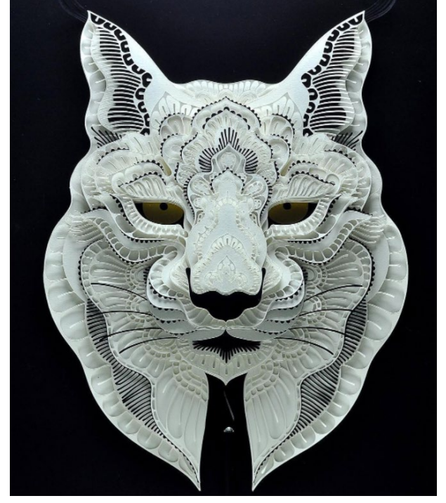
Fig.1 Modern Art Design with Elements of Folk Art Modeling.

The artistic modeling of folk art embodies the inheritance characteristics of traditional art in China, and also has unique visual characteristics. Compared with modern art, folk art modeling is visually distinctive. Based on the schema sample of traditional folk art in China, this paper differentiates, extracts, transfers and reconstructs the internal structure of its modeling, so that modern art design can not only retain the charm of traditional folk art works, but also embody the spirit of the times, and on this basis, convey the design concept and development personality of modern art design. Figure <u>1 shows the application of folk art modeling elements in art design</u>.